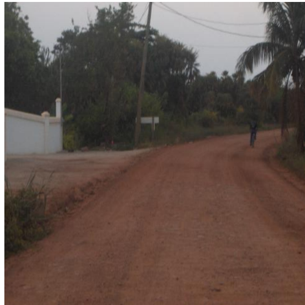
Plate 7.1 Placencia Power line with transformer Plate 7.2 Power line across the Placencia Road